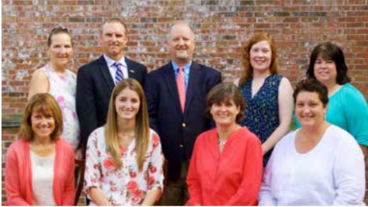
ASSIST central staff International Headquarters Suffield, Connecticut USA